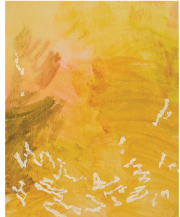
3. Movement Sketch 3 Acrylic and oil pastel on beechwood board 40 × 50CM $1,200.00—