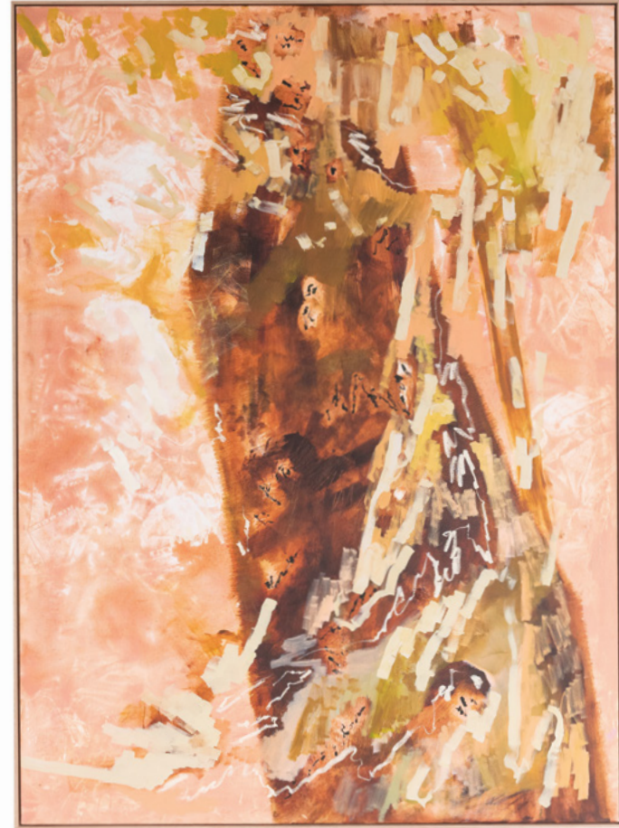
8. Stepping Across Acrylic and oil pastel on canvas framed in Tasmanian Oak 134 × 184CM $7,800.00—