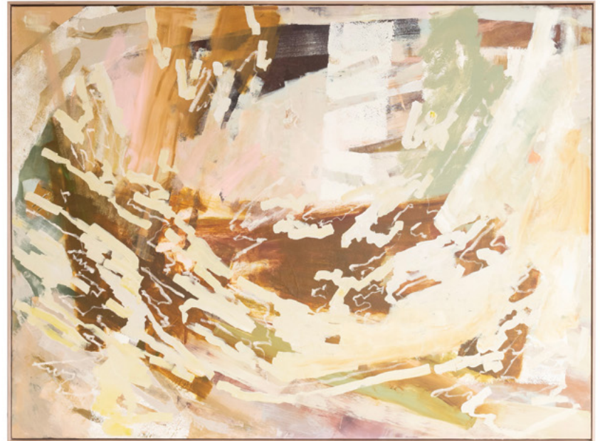
14. Rolling Hills' Acrylic and oil pastel on canvas framed in Tasmanian Oak 134 × 184CM $7,800.00—