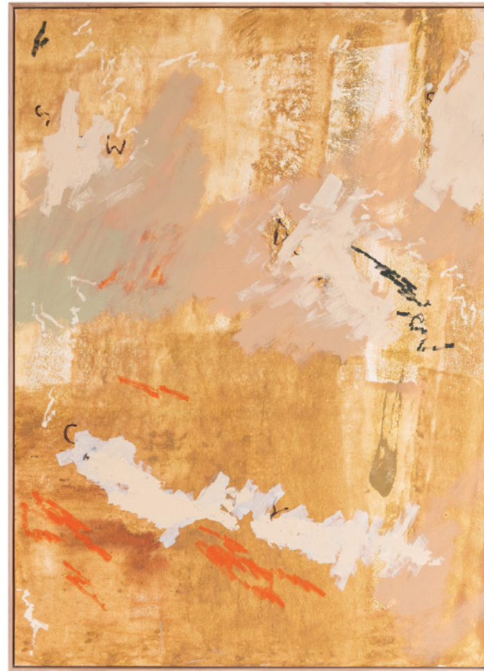
16. Grounded Like This #2 Acrylic and oil pastel on canvas framed in Tasmanian Oak 104 x 144CM $5,600.00—