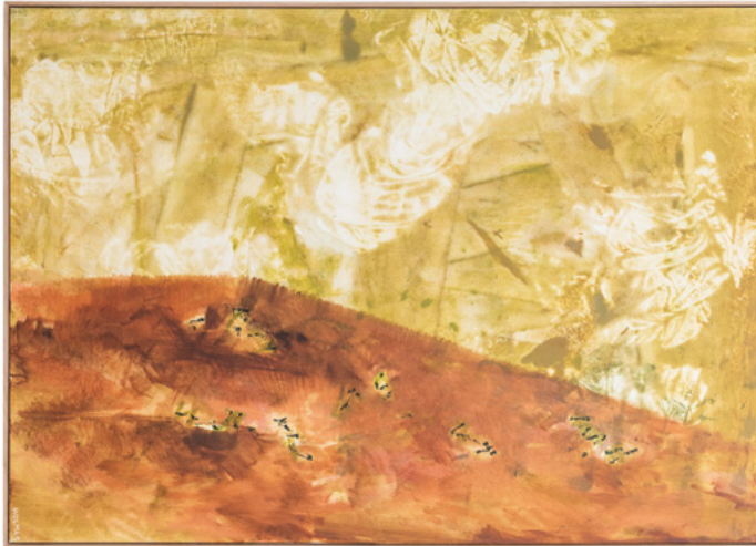
9. Hills Hold Memories Acrylic and oil pastel on canvas framed in Tasmanian Oak 134 × 184CM $7,800.00—