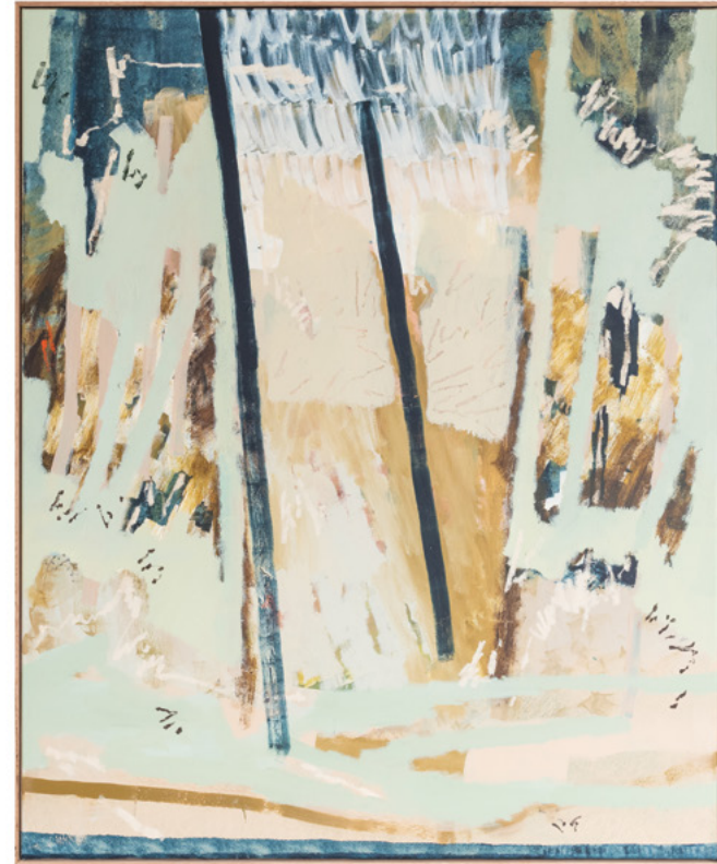
20. Open Water Acrylic and oil pastel on canvas framed in Tasmanian Oak 144 × 174CM $7,800.00—