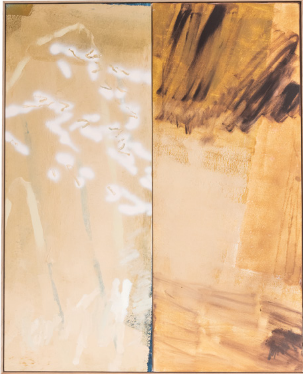
11. Working in Harmony

Diptych - Acrylic and oil pastel on canvas framed in Tasmanian Oak