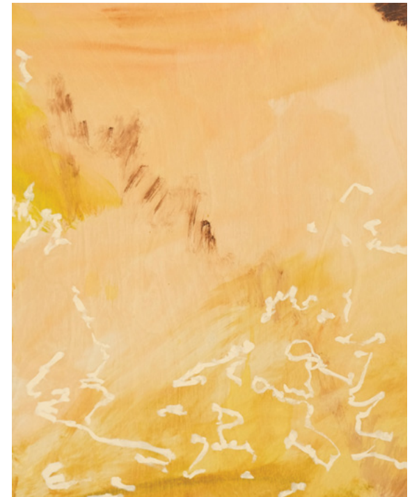
6. Movement Sketch 6 Acrylic and oil pastel on beechwood board 40 × 50CM $1,200.00—