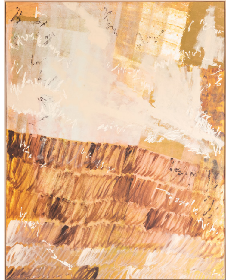
12. Fading Over Fields

Acrylic and oil pastel on canvas framed in Tasmanian Oak