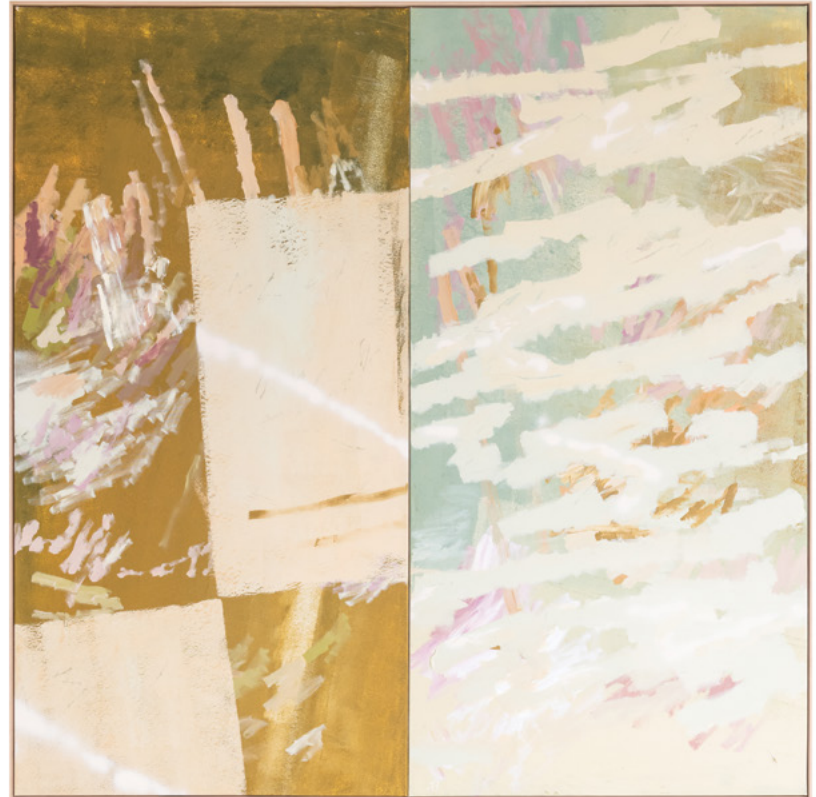
18. Fields to Open Water Acrylic and oil pastel on canvas framed in Tasmanian Oak 184 × 184CM $8,600.00—