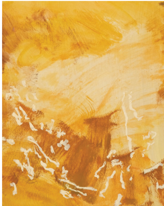
5. Movement Sketch 5 Acrylic and oil pastel on beechwood board 40 × 50CM $1,200.00—