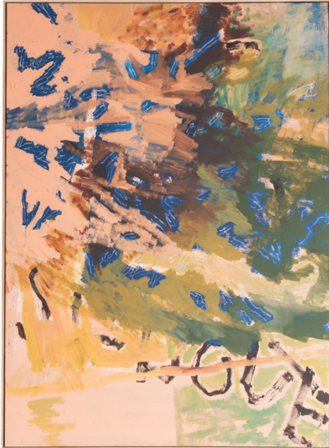
7. Water Lillies Acrylic and oil pastel on canvas framed in Tasmanian Oak 134 × 184CM $7,800.00—