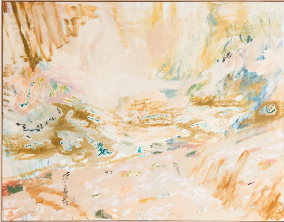
13. The Rivers Story Carries Acrylic and oil pastel on canvas framed in Tasmanian Oak 184 × 234CM $9,400.00—