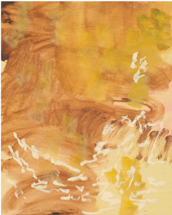
1. Movement Sketch 1 Acrylic and oil pastel on beechwood board 40 × 50CM $1,200.00—

Raw cotton, raw linen, and primed linen canvases. Tasmanian Oak and Walnut timber framing.