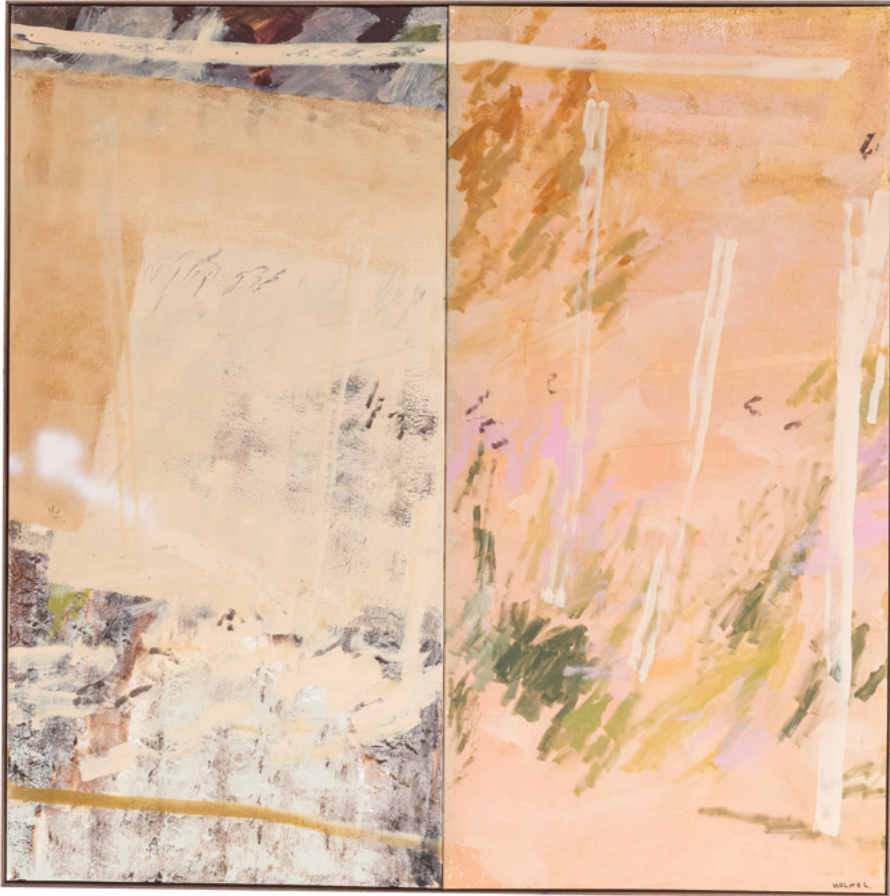
19. Dawn Straight to Dusk Acrylic and oil pastel on canvas framed in Walnut 184 × 184CM $8,600.00—