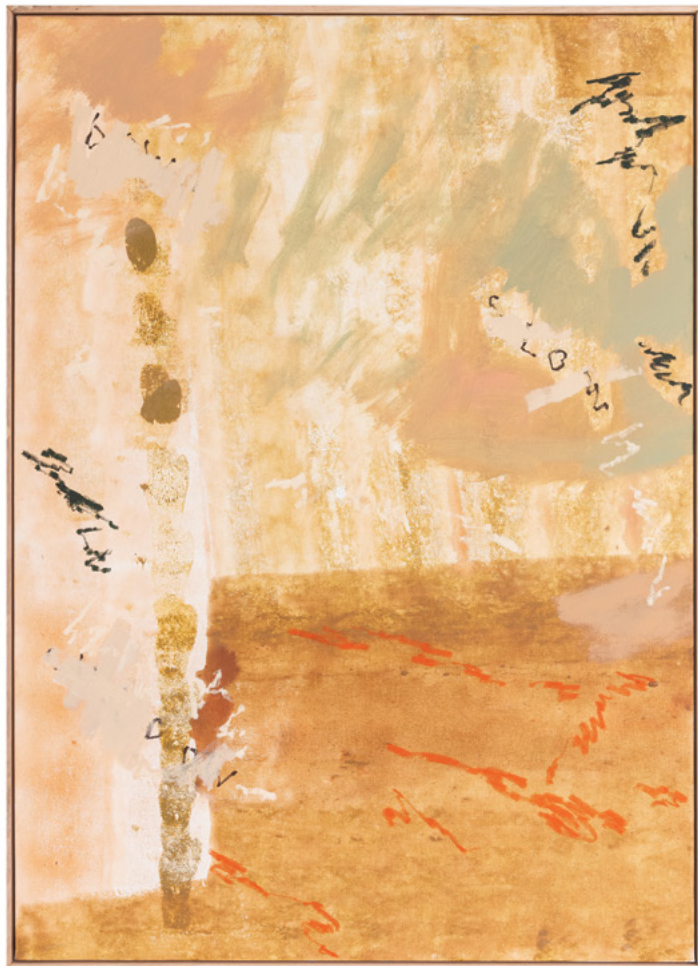
15. Grounded Like This #1 Acrylic and oil pastel on canvas framed in Tasmanian Oak 104 x 144CM $5,600.00—