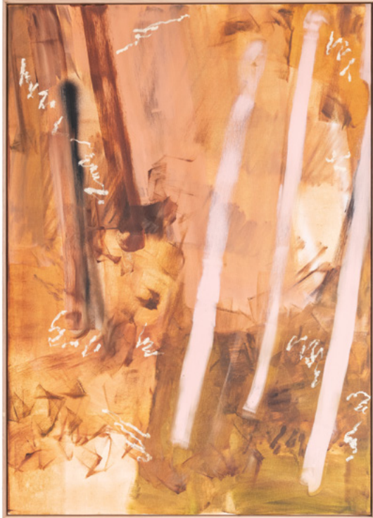
17. Pink Tree Trunks Acrylic and oil pastel on canvas framed in Tasmanian Oak 104 × 144CM $5,600.00—