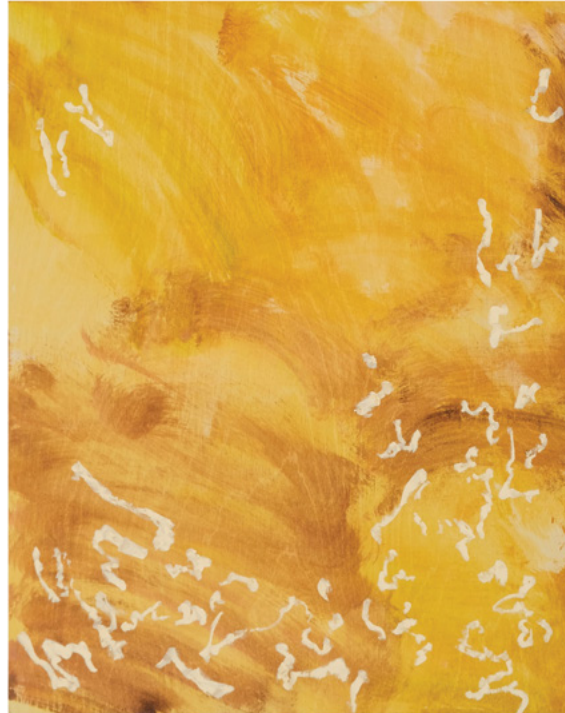
2. Movement Sketch 2 Acrylic and oil pastel on beechwood board 40 × 50CM $1,200.00—