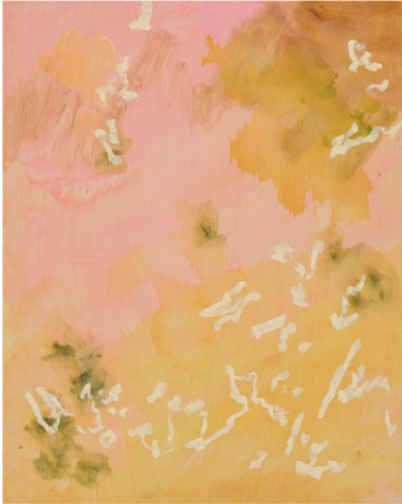
4. Movement Sketch 4 Acrylic and oil pastel on beechwood board 40 × 50CM $1,200.00—