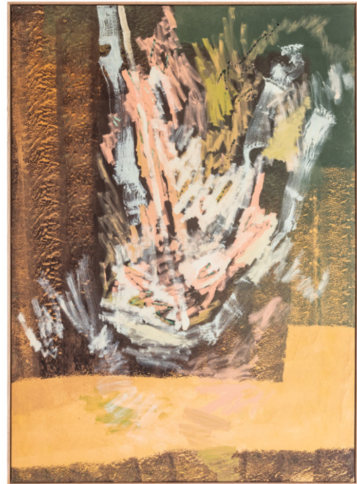
10. Rolling Stone Acrylic and oil pastel on canvas framed in Tasmanian Oak 134 × 184CM $7,800.00—